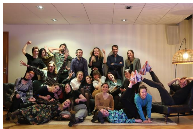
Graduating Cohorts of 2021: Graduates of EPIET, EUPHEM, PAE, Norwegian FETP, MediPIET

As the Board of the EPIET Alumni Network (EAN), and on behalf of the whole network, we would like to warmly congratulate you on completing your fellowship! And to welcome you again, and now, formally as alumni with full membership rights to our EAN family.