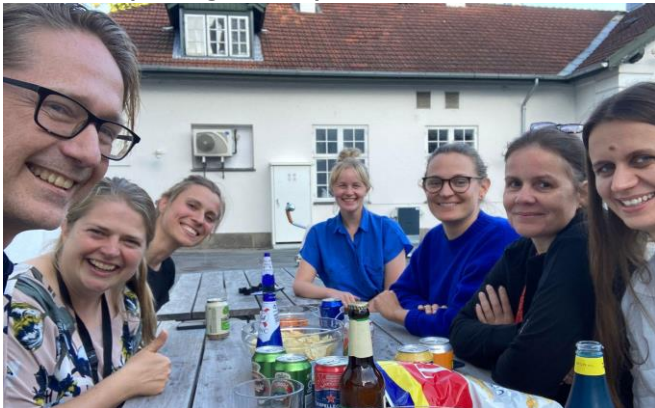
Celebrating the World Field Epidemiology Day in Copenhagen! EPIET and EUPHEM fellows, alumni and former coordinator ☺