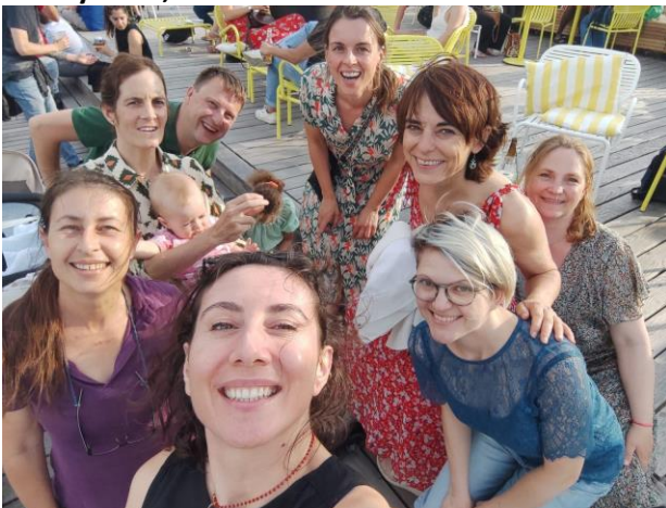
A birthday celebration on a rooftop in sunny Brussels.