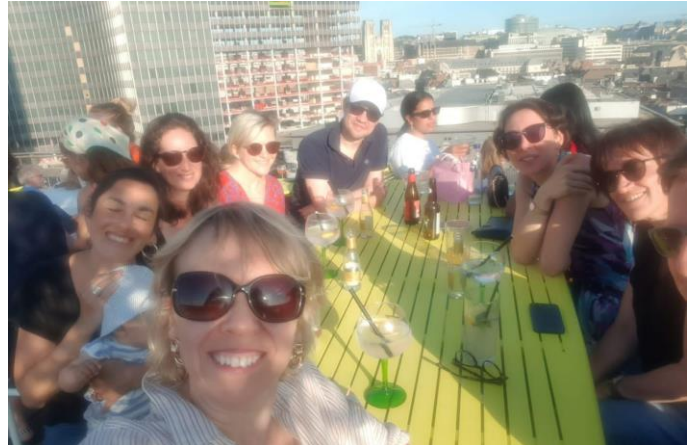
Another of the regular gatherings of the Bruxellian EAN members! Still on the same rooftop, still sunny