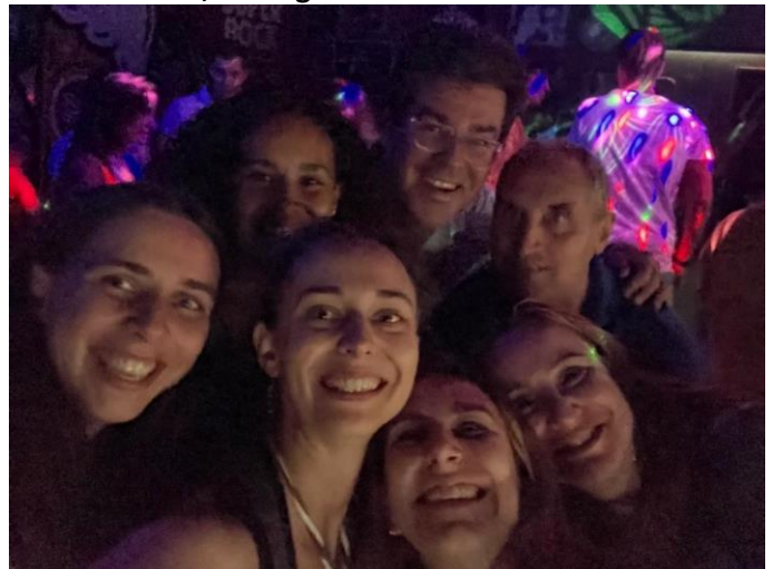
Having fun during the Project Review Module in Lisbon!