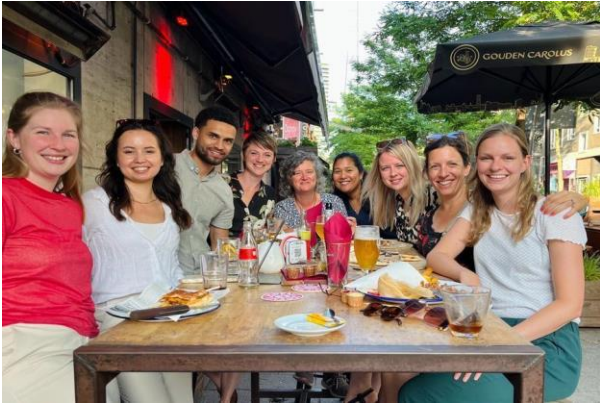
EAN Midsummer celebration following a pre-conference workshop on Applied Field Epidemiology