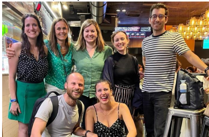
EPIET&EUPHEM meeting in Rome with representatives from 6 different cohorts