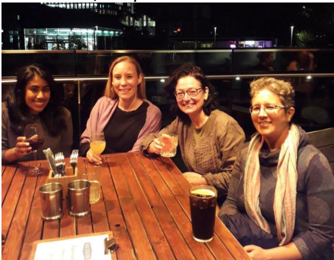
Some of the attendees at the end of dinner!