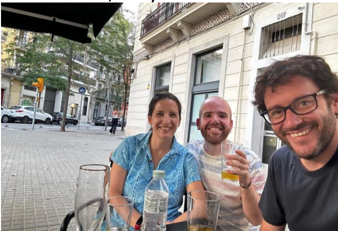
Enjoying a cerveza between EPIET, EUPHEM and UK-FETP alumni in Barcelona!