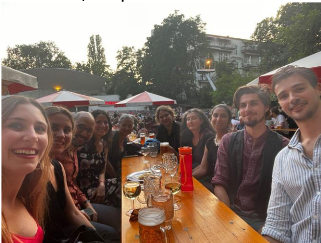
RKI and federal state fellows organised welcome drinks for cohort 2023 in Berlin open to of course to all EAN alumni and friends!