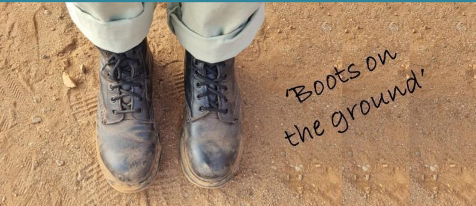
Photograph courtesy of Rachel Merrick, UKFETP Cohort 2021, taken while on deployment with GOARN to the WHO Country Office in Kenya