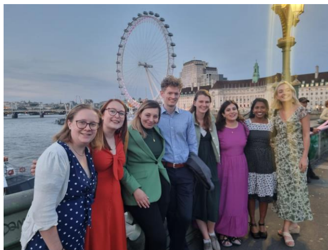
Graduating Cohorts of 2021: Graduates of UK FETP

Renewing your membership is easy and you can do it through our website . If you decide not to become a paying member, do not worry, you can always come back anytime you want to and start paying your membership prospectively only.