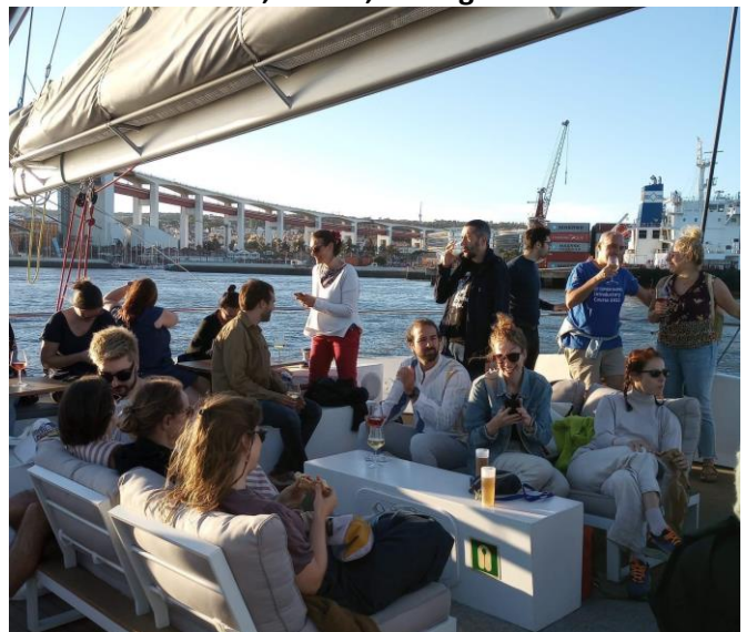
Fellows enjoying a sundowner during the project review module in Lisbon.