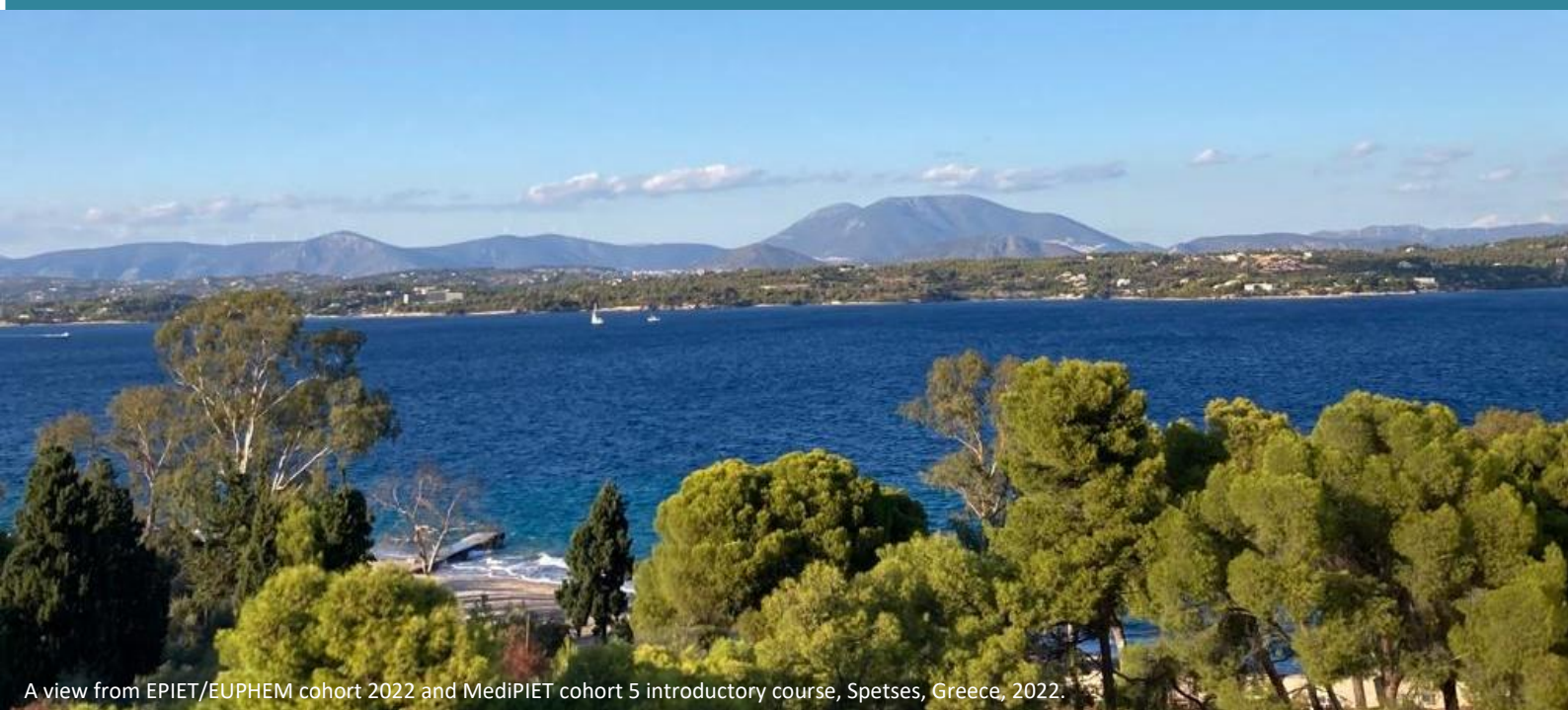
A view from EPIET/EUPHEM cohort 2022 and MediPIET cohort 5 introductory course, Spetses, Greece, 2022.