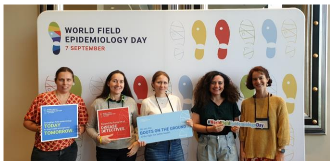
Celebrating World Field Epidemiology Day, 7 th September 2022, Panama