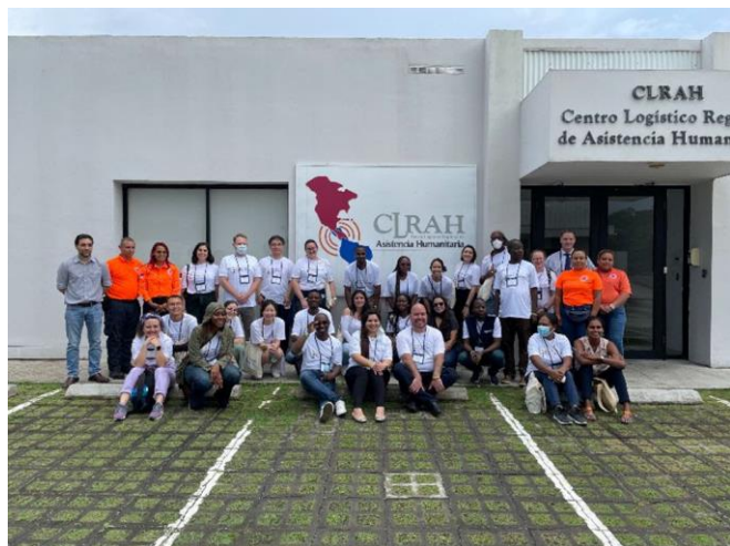
Field Visits to Regional Logistics Center for Humanitarian Assistance, 7 th September 2022, Panama