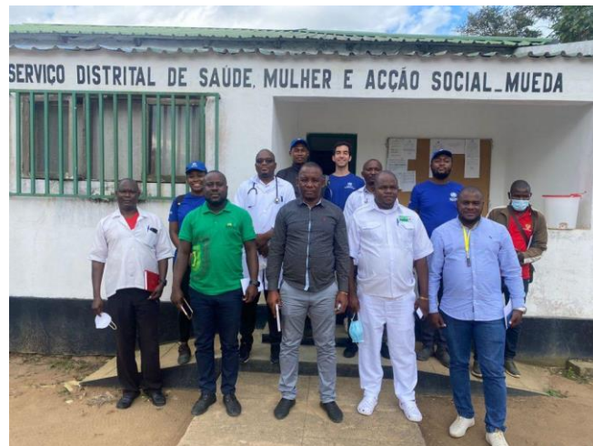
Team preparing for surveillance and vaccination campaigns.

We also responded to an outbreak of rabies in the northern-most districts, where many IDPs are located. We set up a response team with the Ministry of Agriculture, the MoH and FAO. We organised a vaccination campaign for dogs, brought diagnostic kits to the area, created a one health platform for surveillance, and they are now working on getting human post-exposure prophylaxis from other countries for free! It was a great experience.