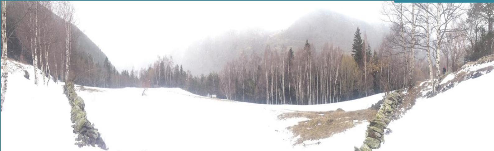
Alós d'Isil, Pyrenees, Spain