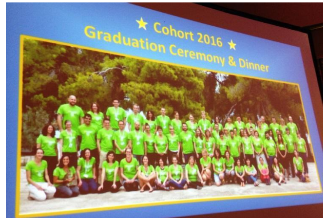
Cohort 2016, with love from Spetses, Greece

We also saw the traditional presentation with fellows’ photos and a great goodbye video prepared by the graduating cohort!