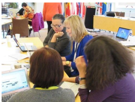
[Photo from TEPHINET training @ ECDC]

FETPs everywhere subscribe to the mandate of building national and global workforce capacity through learning in service to public health. Although programmes share tools, curriculum and personnel, they also organize and deliver their programmes depending on regional and national structures and needs. The growth of this model around the world created a demand for international FETPs to gauge whether their programmes are aligned with, and comparable to, their peers. A TEPHINET working group established measures that would allow programmes to identify areas of improvement and, if desired, apply for external accreditation from TEPHINET. The working group also developed a training module to prepare evaluators for their role: the face-to-face training was piloted at ECDC in February 2017.