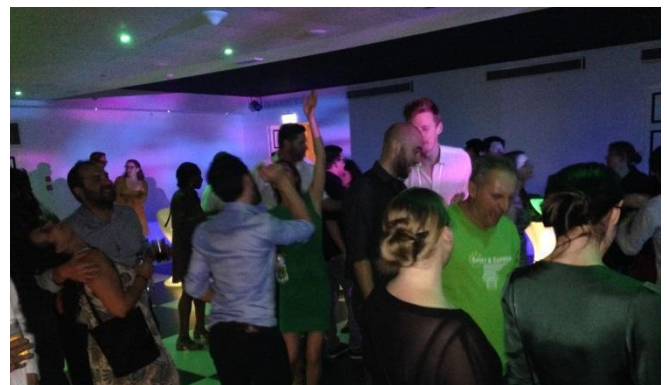
Dancing till the music stopped!

And of course after having eaten well, we joined the lively party that was full of dancing until (unfortunately) 03:00 hrs.