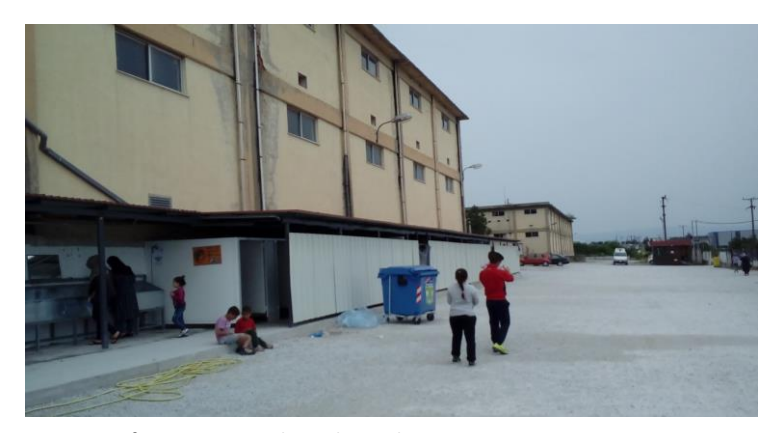
Drama refugee camp in the industrial area

Overall, it was definitely challenging to move constantly to many locations, driving more than 2 500km from the south to the north part of Greece and visit in total 21 different refugee camps and settlements in one month time.