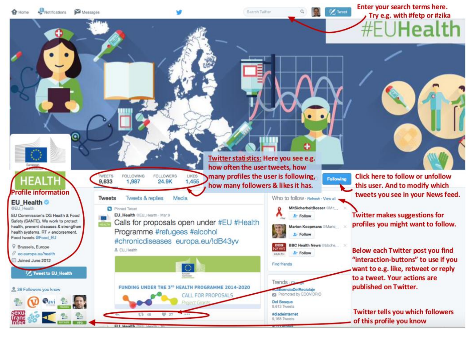
Fig 1: Example of a Twitter Profile: The EU commission on Health

Below is a screenshot of a Twitter Profile. The example used is the official Twitter page of the EU Commission on Health (@EU Health). As stated in the short profile description this profile is dedicated to communicating the work of the EU Commission related to "protecting health, preventing diseases and strengthening health systems". The work of the EU related to Food Safety has its own separate Profile (@Food EU). Highlighted in red are some of the key features of a Twitter profile.