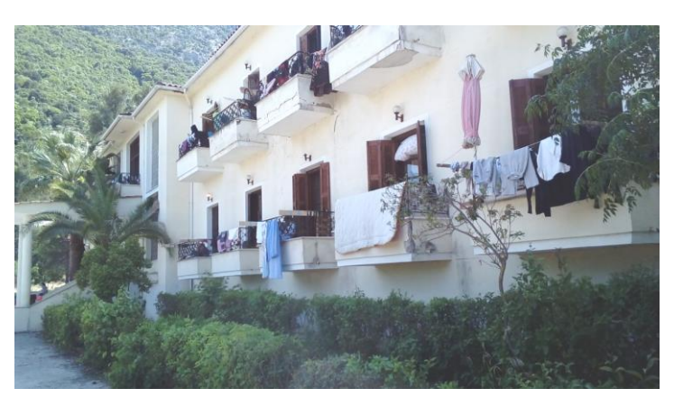
Thermopyles refugee hotel camp (May 2016)

What I have seen that made me also happy is that the ECDC reacted quickly to send us to this mission and as such provided timely the resources for the setup of the surveillance system.