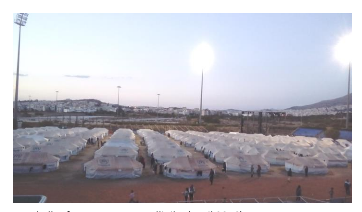
Baseball refugee tent camp, Elliniko (April 2016)

Things went fast, my route had changed and soon I was on mission in Greece supporting ESDY (the National School of Public Health in Athens) and KEELPNO (the National Hellenic CDC) put in place and operate a surveillance system including refugee/migrant points of care. The refugee/migrant population stuck in Greece because of the closure of the border with FYROM in March 2016, was estimated by UNHCR to be at that time more than 50 000 of whom more than 35% were children less than 15 years old; thousands of them living in unplanned camps in Idomeni and Piraeus.