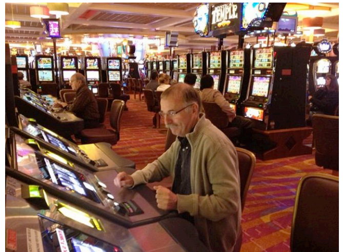
'The Wizard of odds', Mount Pocono, Pennsylvania, USA, by EpiConcept/Epidemiology team

The rest of the pictures, you can find them on facebook .