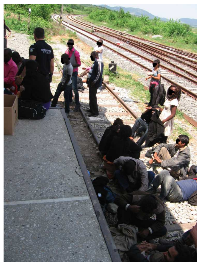
Migrants just after crossing the Evros River, waiting for entry formalities at the railroad of Tychero.

We meet the medical/psycho-social teams from both Feres and Poros here, consisting of a physician, nurse and translators each, and a psychologist for Feres. Each detention centre has its own team to screen incoming migrants medically and psycho-socially. The majority of staff have been deployed since the start in March of a 5 months EU funded project to support third-country nationals in Evros region of Greece. Besides the entry screening, the teams are there to give care and attention to detained migrants upon request.