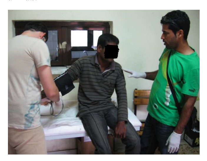
Physician at work: a physical examination during entry screening with help from Sachsa (translator)

Even though those first visits were relatively short in time, they have branded a deep and impressive mark that was not changed by future visits. It was shocking to see people crowded and crammed into a space that was never meant to 'house' so many persons, with very few and poor sanitary facilities, locked-in behind bars, sometimes being shouted at by the police, with little or no access to sunlight and fresh air. It is the sad and lost look in the eyes of some of them that stays with me the most: 'We are less than animals.'