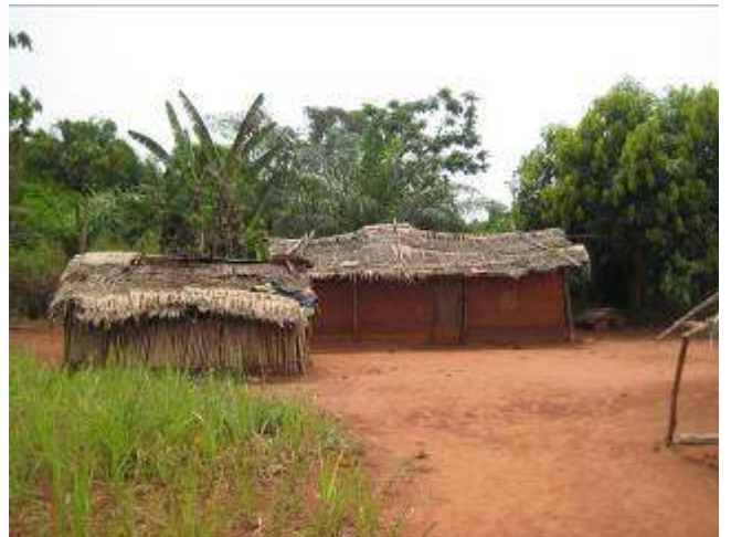
Traditional housing in a village

To set up a surveillance system allowed me to travel and visits remote villages, to enter in little shelters, to meet chiefs of villages and cooperate with them in order to inform the villages about the project; to draw maps showing neglected villages in current census or other registers.