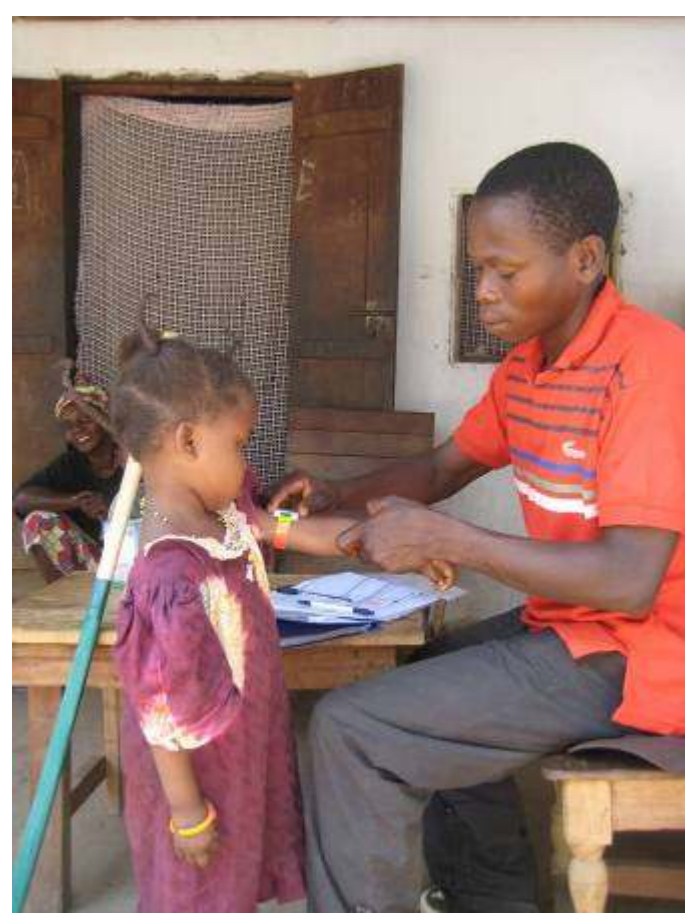
Anthropometric measurement during surveillance activities

By Grazia M. Caleo (EPIET Cohort 15 - EPICENTRE)