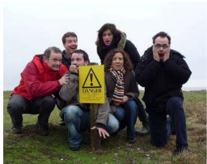
The EAN Board boldly exploring the limits of the known World for the sake of field epidemiology...

The EAN Board held its annual meeting in a lovely cottage on the Suffolk shores in January 2010. During the meeting we discussed future ideas for the EAN, the finances of the EAN, the idea of a member survey in occasion of the 10 years of the EAN, the next ESCAIDE, travel grants, EAN modules, and the Yearbook 2010.